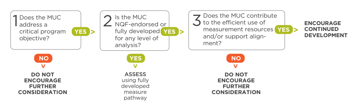
FIGURE 2. MAP PRELIMINARY ANALYSIS ALGORITHM FOR EARLIER STAGE MEASURES

Both NQF members and any interested party can comment on the list of measures under consideration, on individual workgroup decisions, and on broader measurement guidance for federal programs. To provide a transparent process, all submitted comments were posted on the NQF website for public viewing.